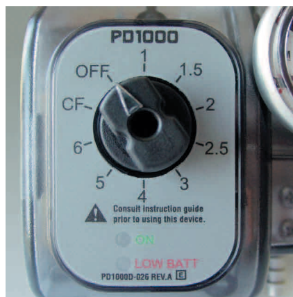
PulseDose volume settings